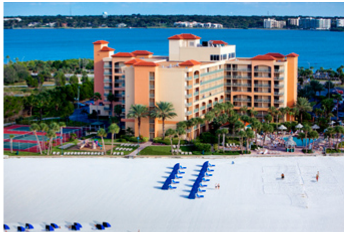
Sheraton Sand Key Resort, Clearwater Beach, Florida

AIChE Reserves a block of rooms every year. Last year, all of our block was booked by early April! Don't miss your chance to book early!